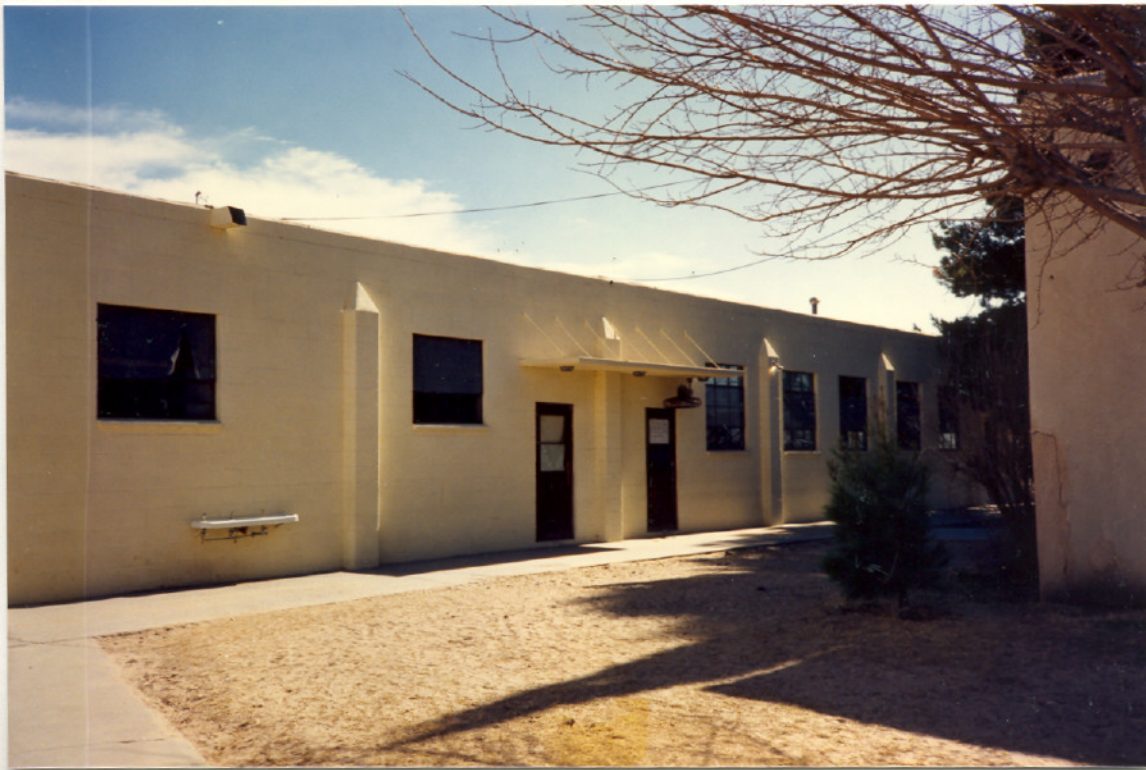
03 - Cafeteria