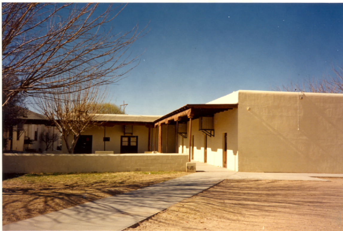
02 - Classroom