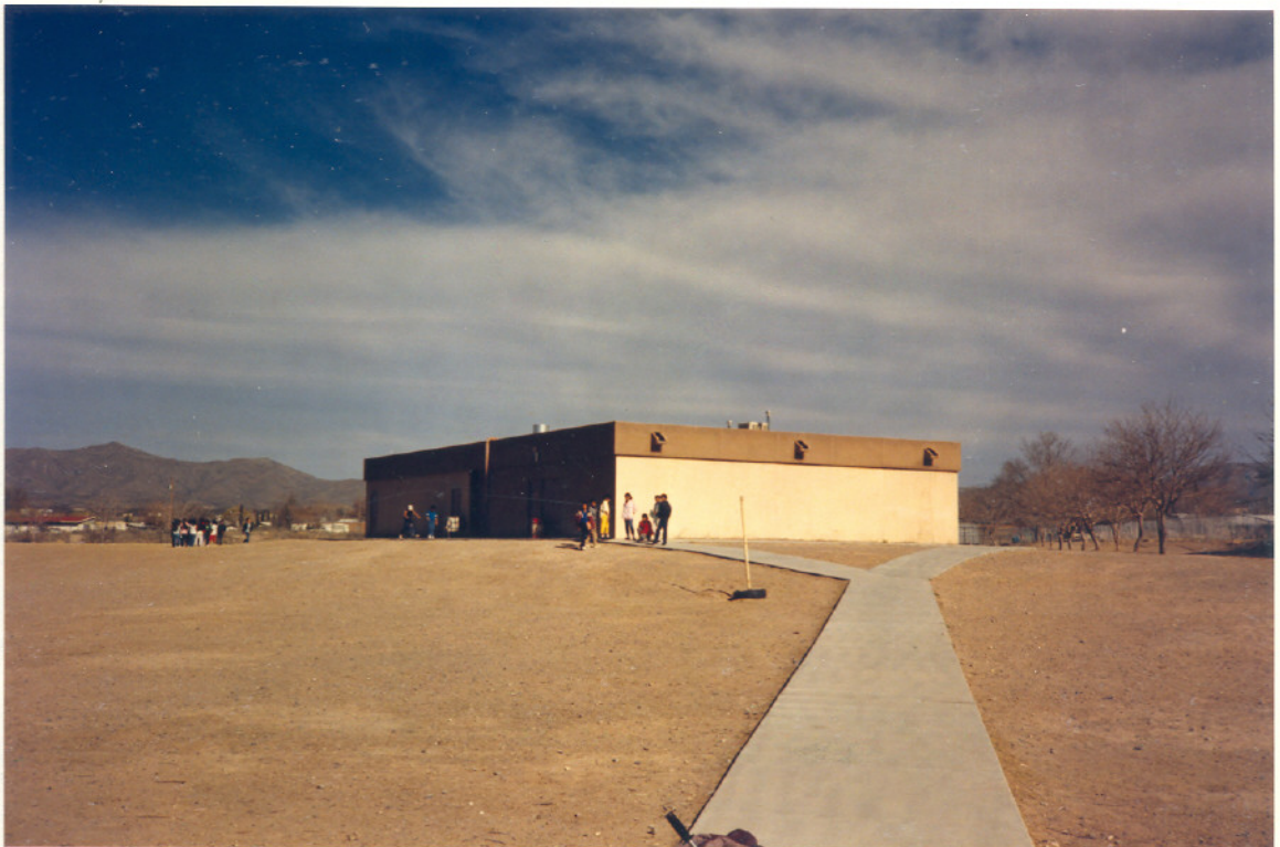
04 - Classrooms & Locker Rooms