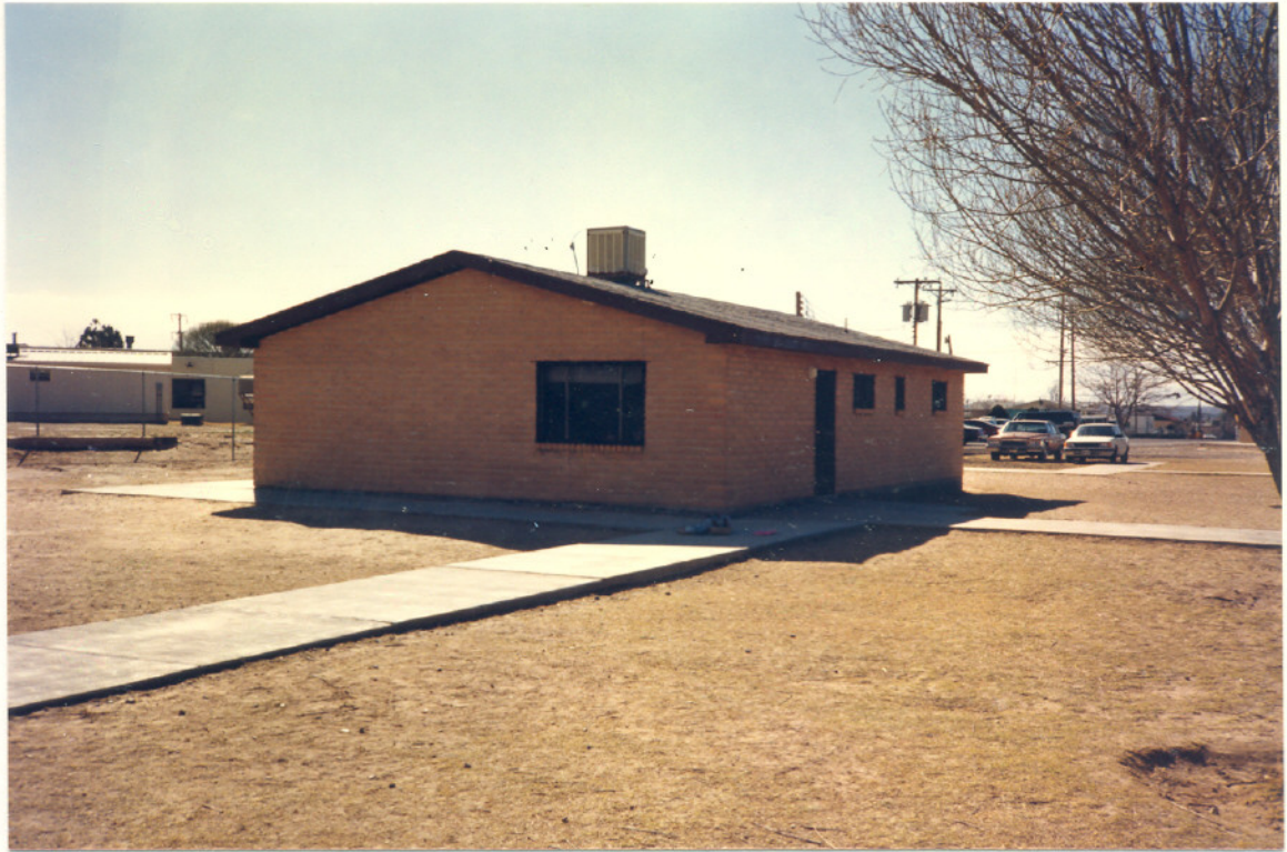
03 - Nurses Residence