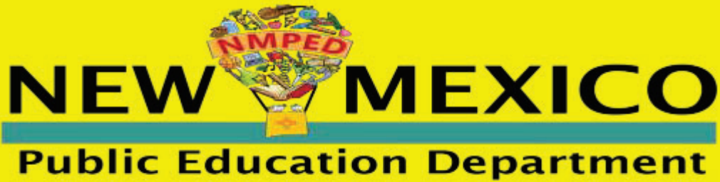
EXHIBIT A (11000 - FINAL FY21-22)